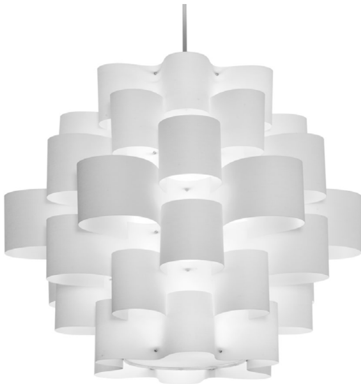
10 Light Zulu Pendant White

Height 35.5 Width/Length 36 Depth 36 Weight 20