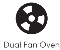
Dual Fan Oven