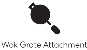
Wok Grate Attachment