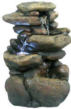
Fountain (LED Lights Pre Installed) 1x