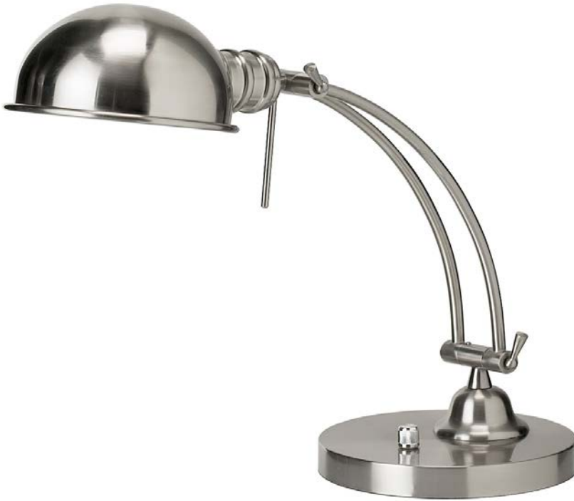
Pharmacy Desk Lamp, Satin Chrome, Adjustable Arm and Shade

Height 18 Width/Length 14 Depth 7 Weight 6