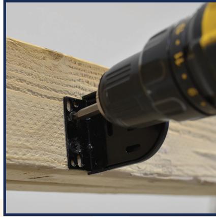
2. Install brackets