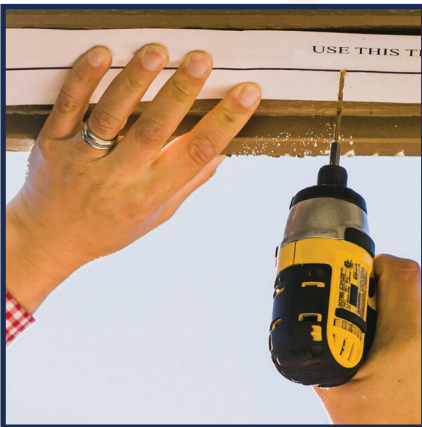
1. Align pilot holes using included template