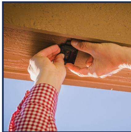
2. Install brackets