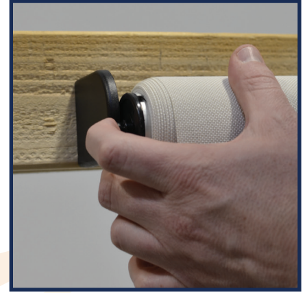
3. Place shade into brackets