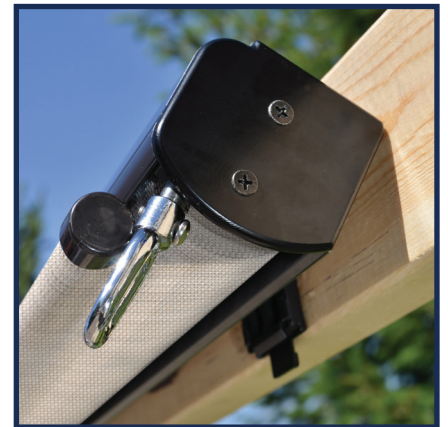
3. Click shade into place