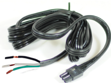
72" 3-Wire Grounded Hardwire Connector

NUA-803 Used to join two NUD-88 fixtures seamlessly together. 3-wire grounded connector. Finish: White