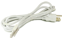
72" Cord & Plug

NUA-804B Black NUA-804W White Used to hardwire NUD-88 fixtures to NUA-802 or junction box (by others). Finish: Black or White