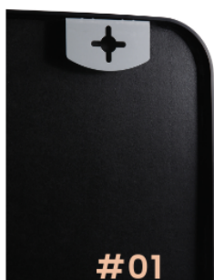
Figure out a place that you wanna hang the mirror. Then mark the height using a pencil align a ruler with the top of the holes on the back of the mirror