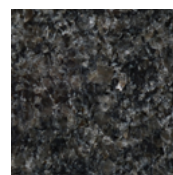
CHARCOAL LITE-CORE L

For Quick Ship or Extended Lead Time SKU status, please call 877-866-3331 or email sales@oxfordgarden.com .