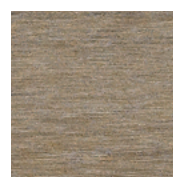
VINTAGE TEKWOOD V