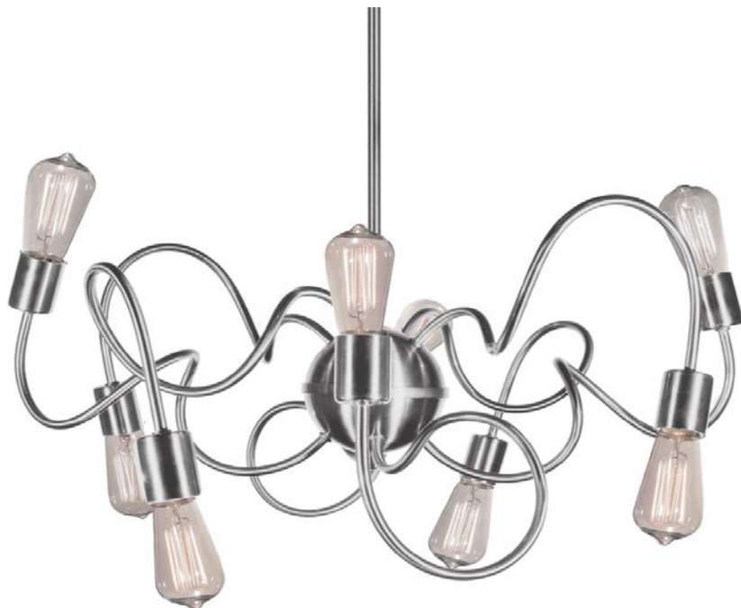
8 Light Pendant, Satin Chrome Finish, w/ Vintage Bulbs

Height 16.5 Width/Length 25 Depth 25 Weight 10