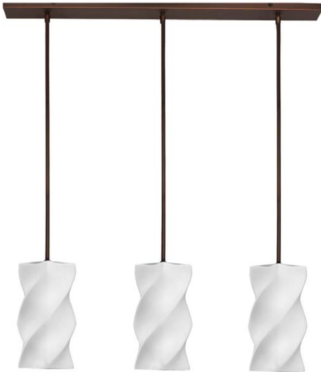
3 Light Horizontal Pendant, Oil Brushed Bronze Finish, Frosted Glass Twisted Glass

Height 11 Width/Length 5 Depth 5 Weight 20