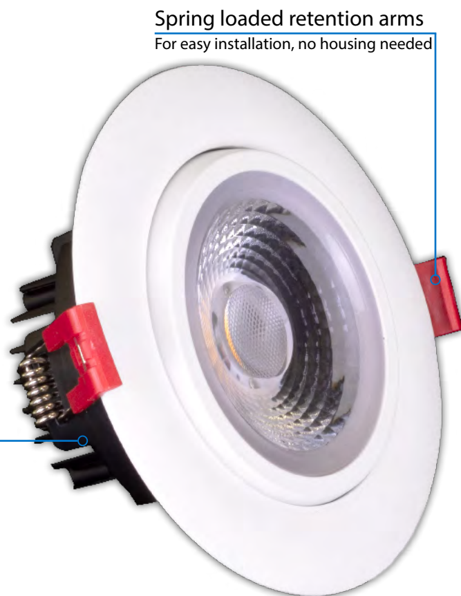
Spring loaded retention arms

For easy installation, no housing needed