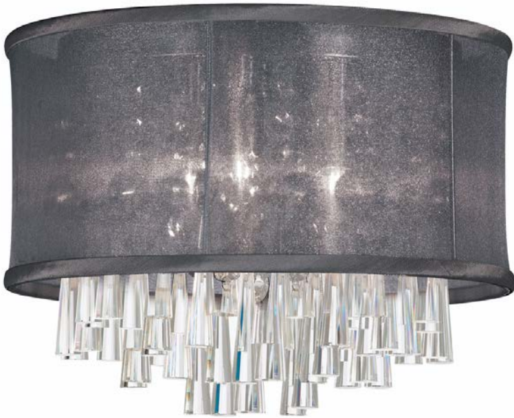
4 Light Crystal Flush Mount Fixture, Polished Chrome, Black Organza Drum Shade

Height 10 Width/Length 16 Depth 16 Weight 10