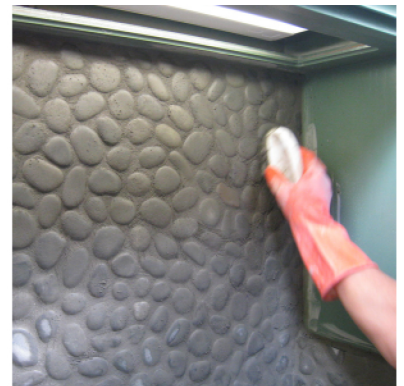
One inch bristle brush