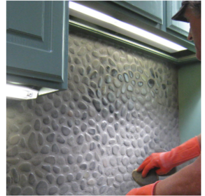
Pebbles are visible