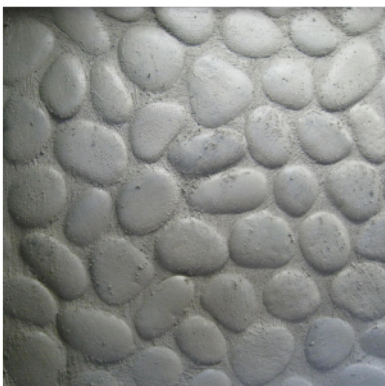
Grout is recessed