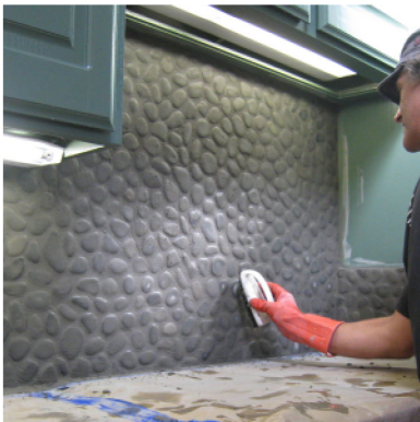
Sweep out more grout with a brush