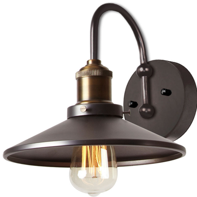
1 Light Wall Sconce, Vintage Steel / Antique Brass

Height 8.5 Width/Length 9 Depth 9.25 Weight 2