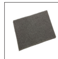
Scotch-Brite (for repairs)