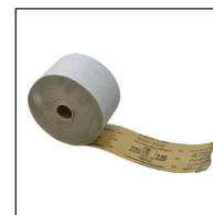
200-300 Grit Sandpaper (for repairs)