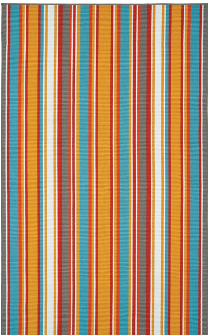
VOA09-89 | Orange