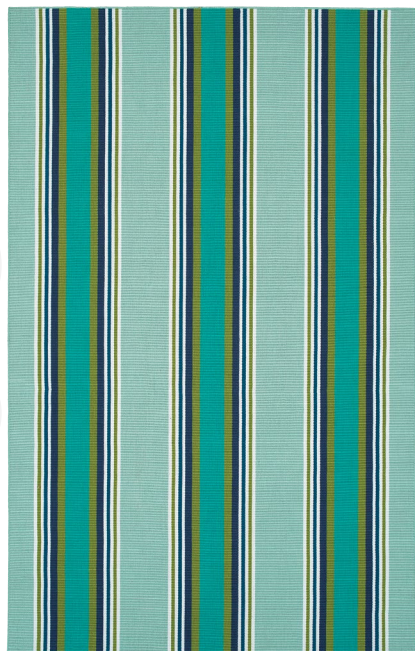
VOA03-104 | Seafoam