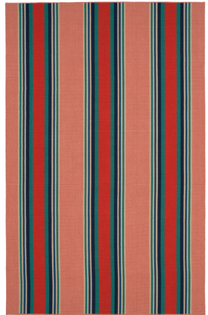
VOA03-97 | Salmon