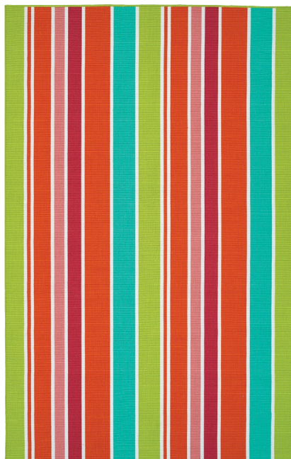
VOA05-86 | Multi