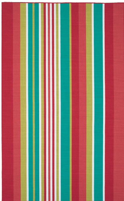
VOA07-99 | Coral