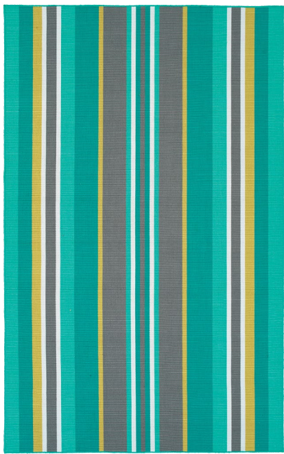
VOA08-91 | Teal