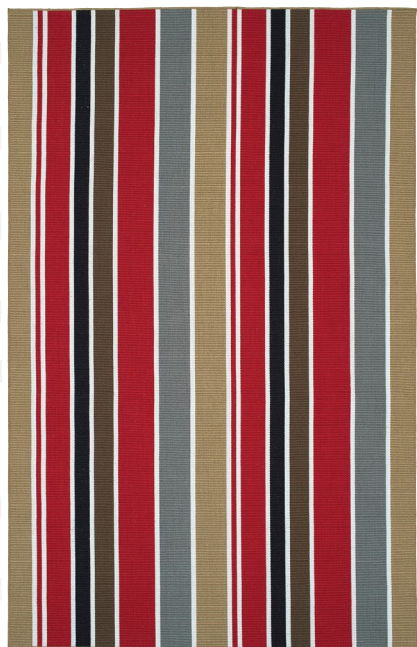
VOA05-25 | Red