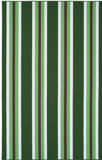
VOA02-50 | Green