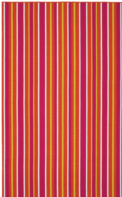
VOA09-92 | Pink