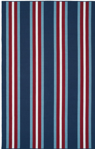
VOA02-17 | Blue