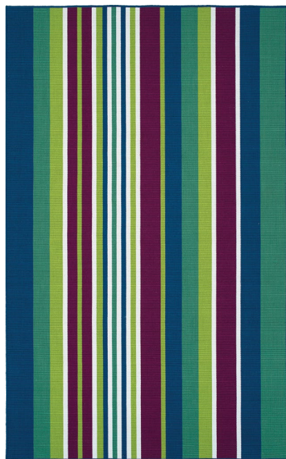
VOA07-87 | Plum