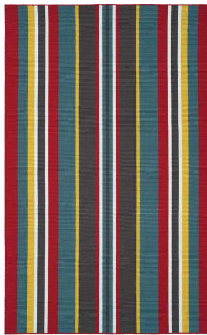
VOA08-25 | Red