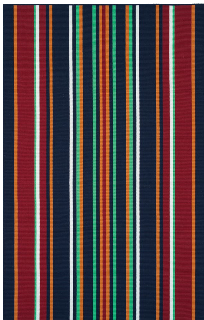
VOA06-22 | Navy