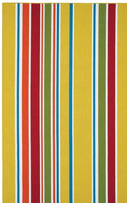
VOA04-28 | Yellow