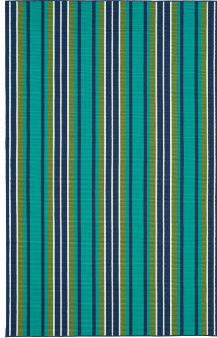
VOA01-91 | Teal