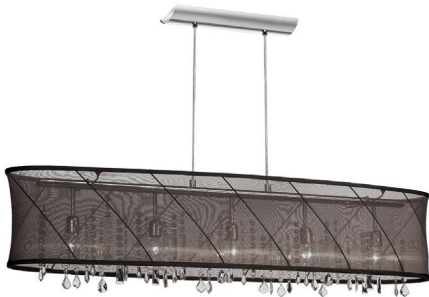
5 Light Polished Chrome Crystal Pendant with Black/Silver Swirl Shade

Height 12 Width/Length 44 Depth 10 Weight 20