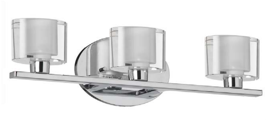
3 Light Vanity Fixture, Polished Chrome, Oval Crystal

Height 5 Width/Length 3.5 Depth 16.5 Weight 4.6