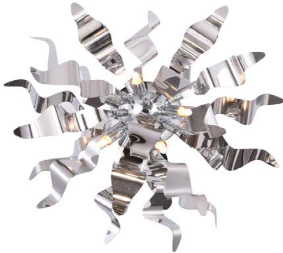
5 Light Flushmount with Wavelet Ribbons, Polished Chrome Finish

Height 10 Width/Length 16 Depth 16 Weight 10