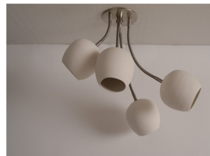
Day light image