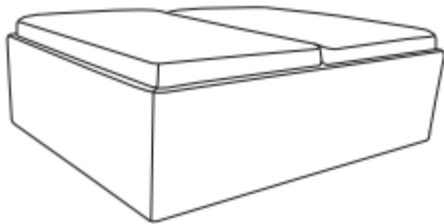
OTTOMAN QTY 1