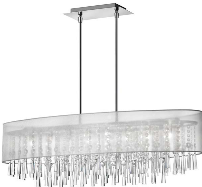
8 Light Polished Chrome Oval Crystal Pendant with Silver Laminated Orgza Shade

Height 12 Width/Length 38 Depth 12 Weight 15