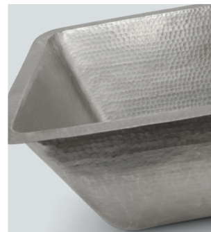
Bar & Prep Sinks