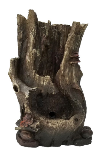
Fountain (LED lights pre-installed) 1x