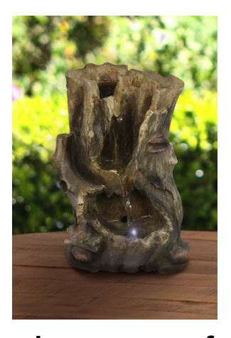
Relax and enjoy your new fountain.

8. Congratulations, your fountain is now complete. Don't forget to add water regularly as water will evaporate over time.