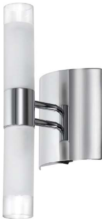
2 Light Wall Sconce, Polished Chrome, Clear Frosted Glass

Height 12 Width/Length 4 Depth 4 Weight 2