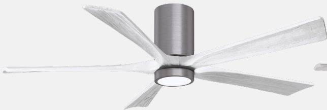
IR5HLK-BP-MWH-60 Brushed Pewter Finish, with 60" Matte White Blades