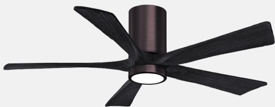
IR5HLK-BB-BK-52 Brushed Bronze Finish, with 52" Matte Black Blades