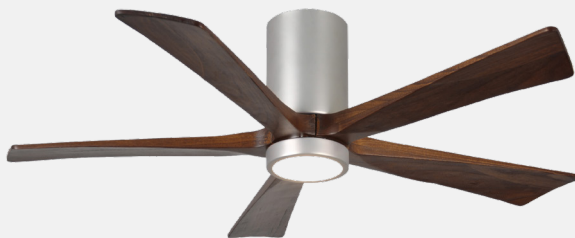
IR5HLK-BN-WA-52 Brushed Nickel Finish, with 52" Walnut Tone Blades