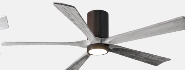
IR5HLK-TB-BW-60 Textured Bronze Finish, with 60" Barn Wood Tone Blades