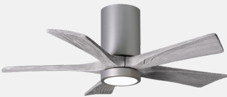
IR5HLK-BN-BW-42 Brushed Nickel Finish, with 42" Barn Wood Tone Blades