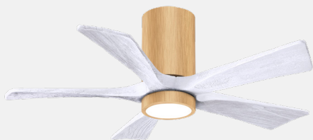
IR5HLK-LM-MWH-42 Light Maple Tone Finish, with 42" Matte White Blades