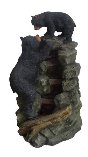
Fountain (3 LED lights pre-installed) 1x