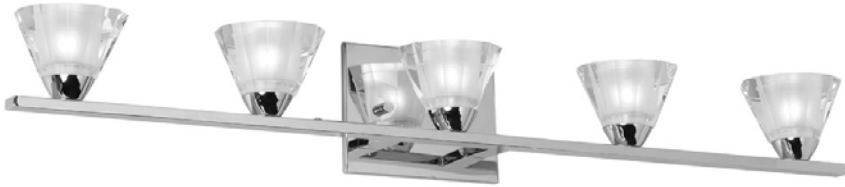
5 Light Vanity, Polished Chrome, Optical Crystal

Height 6 Width/Length 29.5 Depth 3.5 Weight 7.8