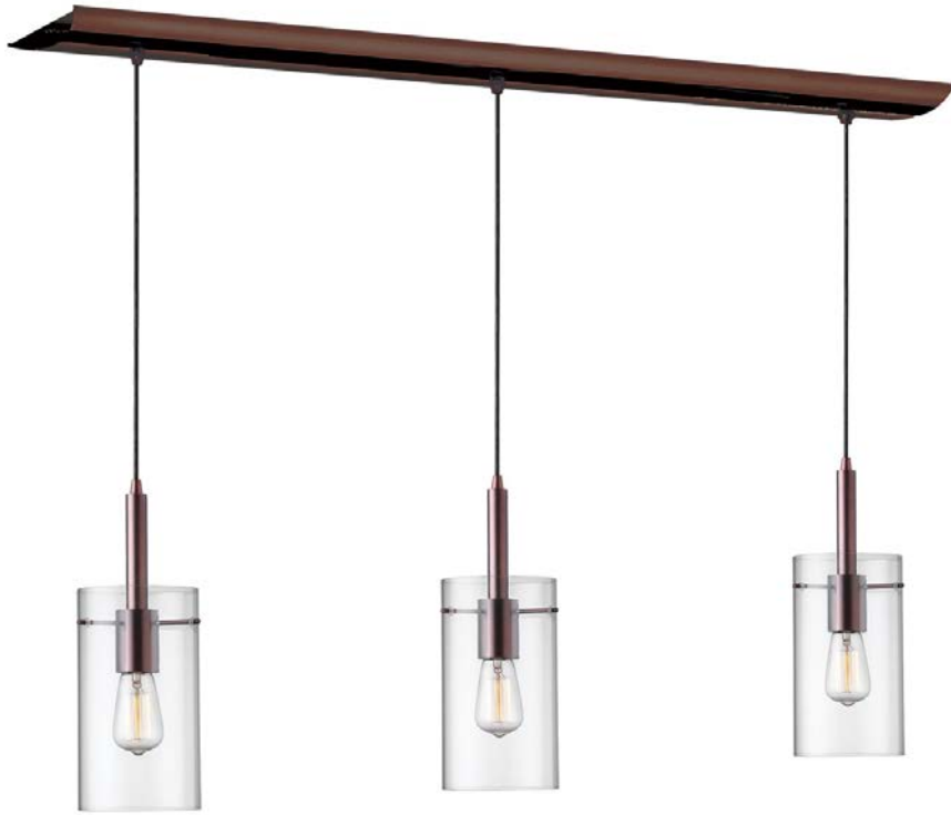
3 Light Pendant, Oil Brushed Bronze Finish, Clear Glass Shade

Height 16.5 Width/Length 5.5 Depth 5.5 Weight 12