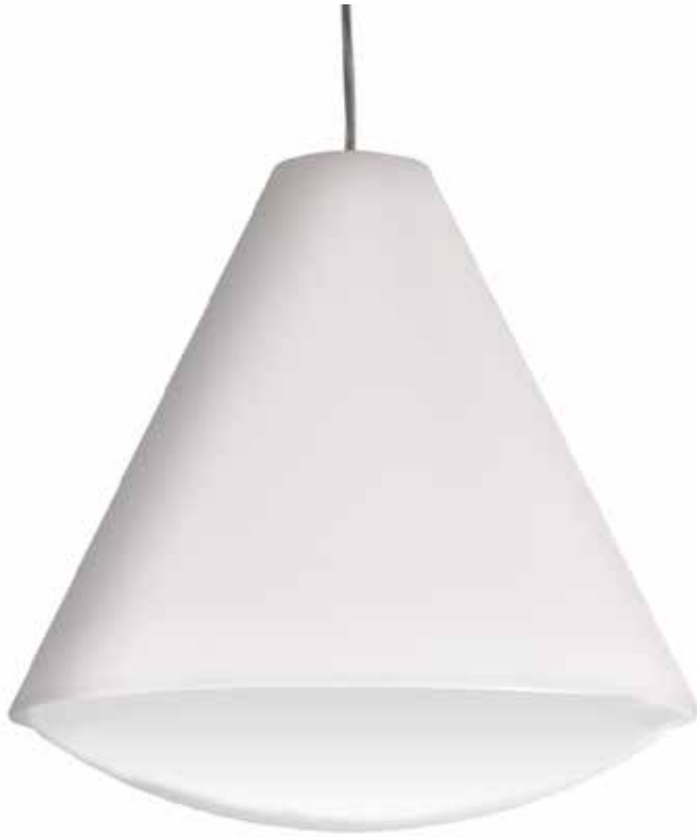
LED Pendant Empire Shade, White