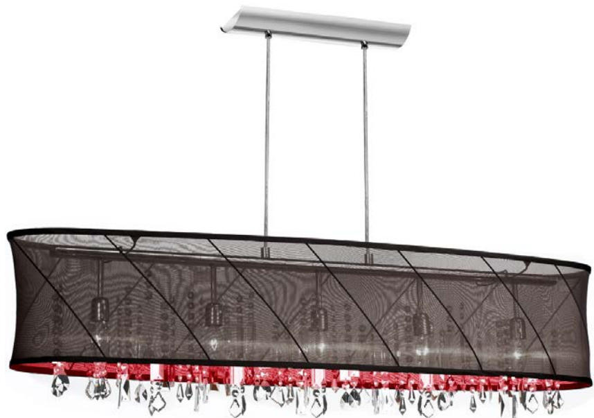
5 Light Polished Chrome Crystal Pendant with Black/Red Swirl Shade

Height 12 Width/Length 44 Depth 10 Weight 20