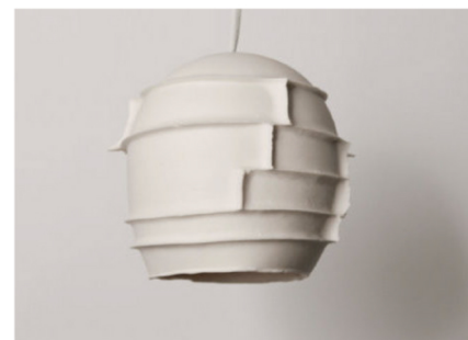
Day light image