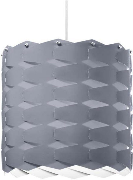
1 Light Cross Hatch Pendant, Polished Chrome

Height 13 Width/Length 12 Depth 12 Weight 6.5