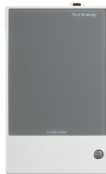
USG-4000: Power module for large applications.