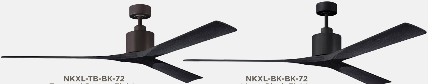
NKXL-TB-BK-72 Textured Bronze Finish, with 72" Matte Black Blades