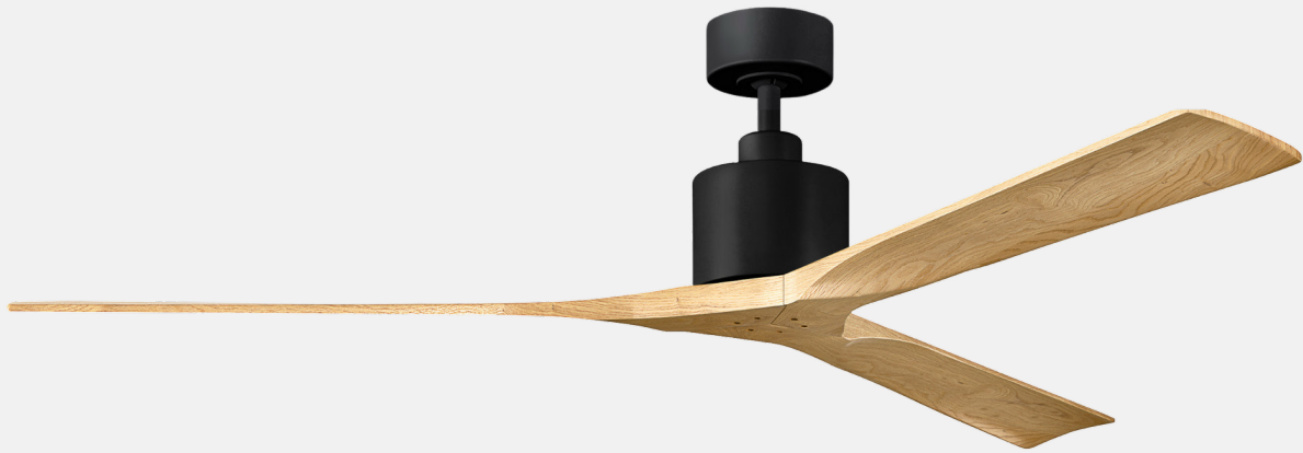
Shown: NKXL-BK-LM-72 Matte Black Finish, with 72" Light Maple Tone Blades