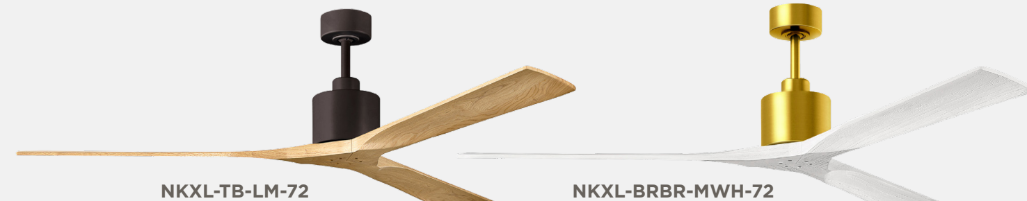
NKXL-TB-LM-72 Textured Bronze Finish, with 72" Light Maple Tone Blades