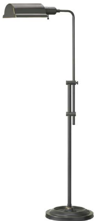
Adjustable Floor Lamp, Dark Oil Brushed Bronze

Height 52 Width/Length 20 Depth 10 Weight 13