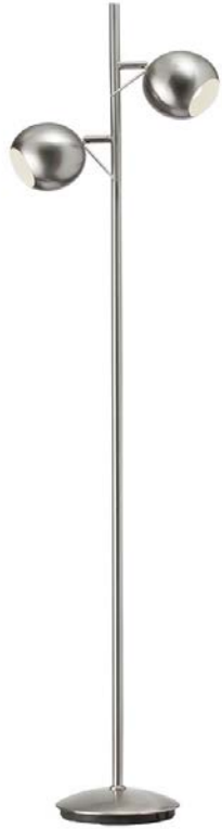
2 Light Floor Lamp, Satin Chrome Finish

Height 55 Width/Length 15 Depth 9 Weight 10