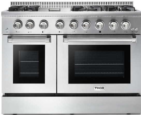
Product: 48 Inch Professional Dual Fuel Range in Stainless Steel Model Number: HRD4803U / HRD4803ULP