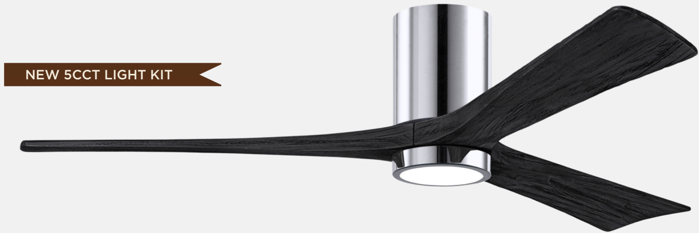
Shown: IR3HLK-CR-BK-60 Polished Chrome Finish, with 60” Matte Black Blades