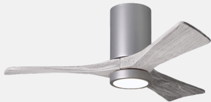
IR3HLK-BN-BW-42 Brushed Nickel Finish, with 42” Barn Wood Tone Blades