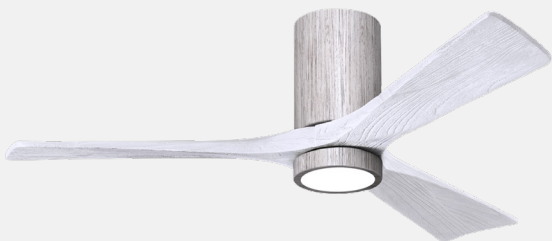
IR3HLK-BW-MWH-52 Barn Wood Tone Finish, with 52” Matte White Blades