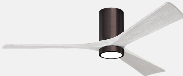
IR3HLK-BB-MWH-60 Brushed Bronze Finish, with 60” Matte White Blades