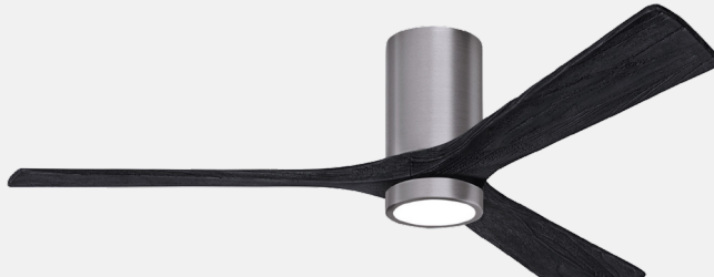
IR3HLK-BP-BK-60 Brushed Pewter Finish, with 60” Matte Black Blades