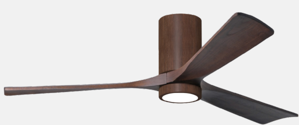
IR3HLK-WN-WA-52 Walnut Tone Finish, with 50” Walnut Tone Blades