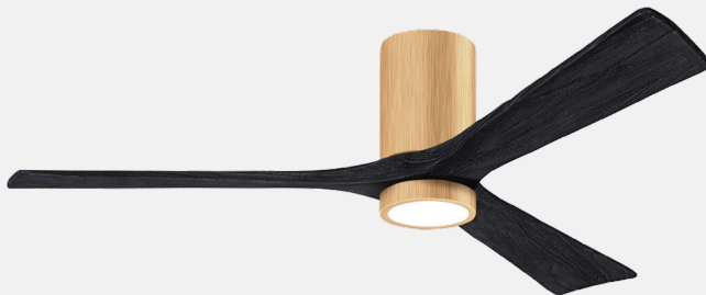
IR3HLK-LM-BK-60 Light Maple Tone Finish, with 60” Matte Black Blades