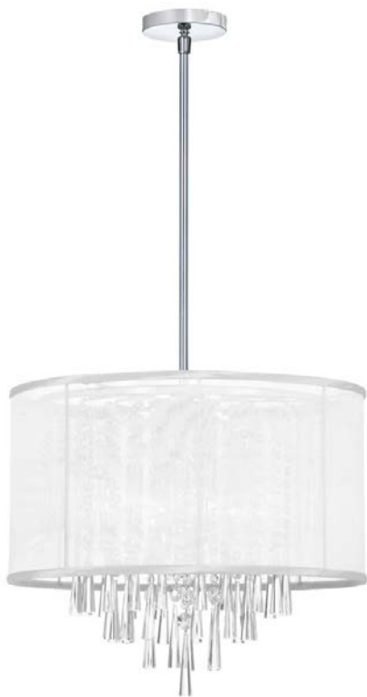
6 Light Crystal Chandelier, Polished Chrome, White Organza Drum Shade

Height 17 Width/Length 18 Depth 18 Weight 10