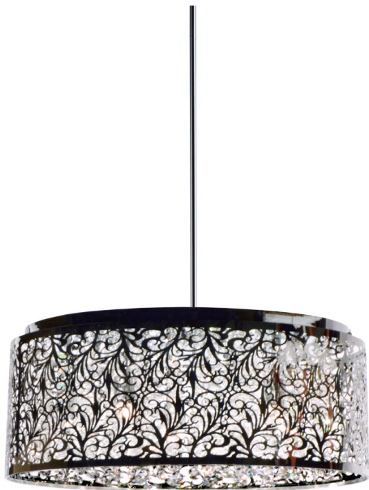
8 Light Crystal Chandelier With Floral Pattern, Polished Chrome Finish

Height 9.5 Width/Length 20 Depth 20 Weight 16