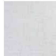
Linen White (LW)