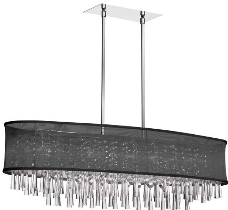
8 Light Crystal Oval Chandelier, Polished Chrome, Oval Black Organza Shade

Height 12 Width/Length 38 Depth 12 Weight 15